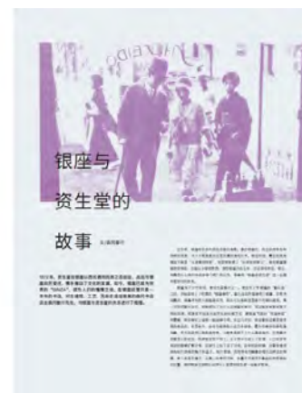
"GINZA and SHISEIDO" Feature