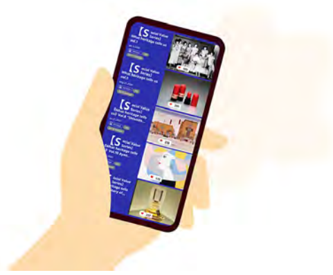
"What Heritage Tells Us," a series of brief stories, shared on our intranet

Through times of adversity and turbulence, the passion and dedication of Shiseido employees worldwide have enabled us to overcome significant challenges. Throughout our history, innovation has paved the way for a future of beauty. That remains true to this day, and our heritage continues to spark the creativity needed to carry us forward. It is with this belief that we launched "What Heritage Tells Us" in April 2020 – a series of brief stories shared on our intranet. The stories revisit innovations and achievements throughout our 149-year history, highlighting the ways in which our founders and employees overcame adversity to ensure the future of Shiseido.