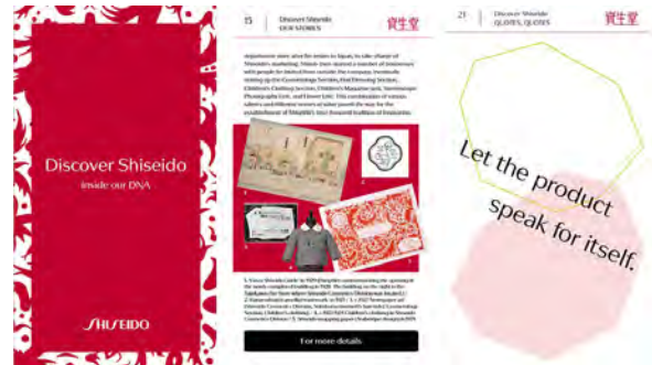
Discover Shiseido — Inside our DNA

Our workplaces around the world are home to a diverse range of people. In 2020, in order to deepen our employees' understanding of our DNA, we published Discover Shiseido — Inside our DNA (available in Japanese, English, Chinese and French). The publication focuses on Shiseido's heritage from the viewpoint of innovation, presenting our origins, philosophy, history, culture, and more, in a compact pocketbook.