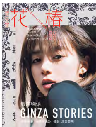
"Hanatsubaki" Chinese Issue

By offering Hanatsubaki magazine in Chinese, we aim to share our unique sense of Japanese beauty and deep cultural insights with a new audience and a younger generation of readers. In doing so, we hope to stimulate interest in, and build preference for, Shiseido in China.