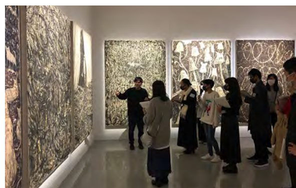
The 14th shiseido art egg, featuring artist Taishi Nishi's "Ghost Demo"

In 2020, the Shiseido Gallery held a number of exhibitions to encourage dialogue and interaction between Shiseido employees and guest artists. The aim of these exhibitions was to create new opportunities for Shiseido brands, employees and artists alike, by providing a platform for creativity, learning and knowledge sharing.