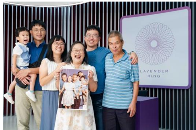
MAKEUP & PHOTOS WITH SMILES Taiwan