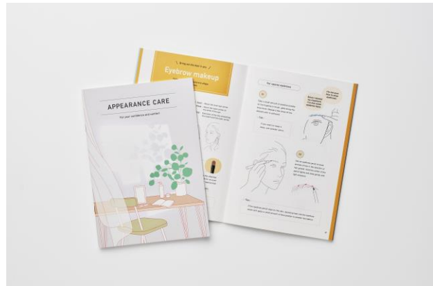
"Appearance Care for your Confidence and Comfort" Booklet