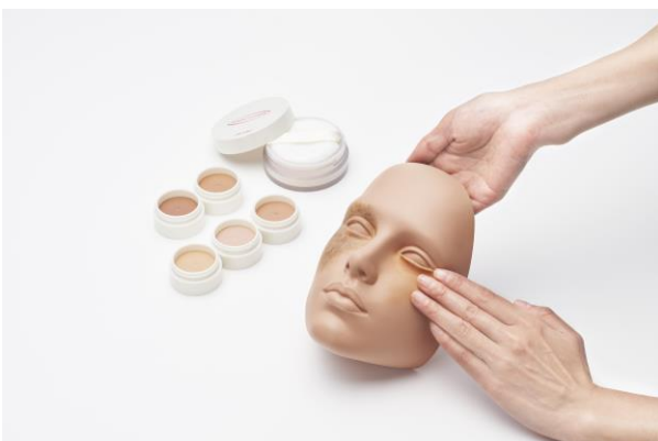
"Perfect Cover" that covers deep skin concerns