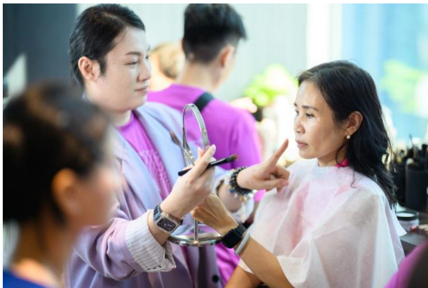
MAKEUP & PHOTOS WITH SMILES Singapore