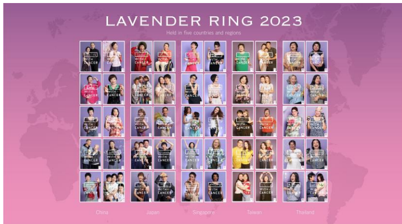
MAKEUP & PHOTOS WITH SMILES 2023