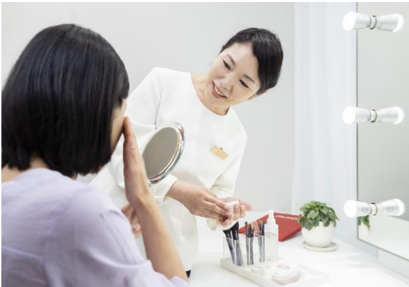
Counseling at Shiseido Life Quality Beauty Center

*5 Download Appearance Care Booklet: https://corp.shiseido.com/slqm/en/assets/pdf/appearance-care-book.pdf