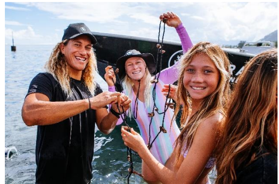
※Coral preservation activities in Tahiti, 2022