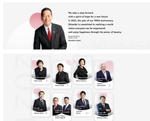
Integrated Report: Message