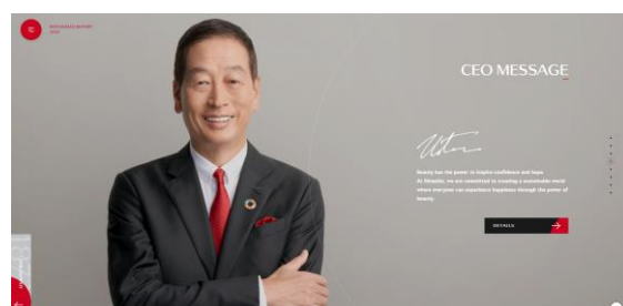
Integrated Report: Message from the CEO