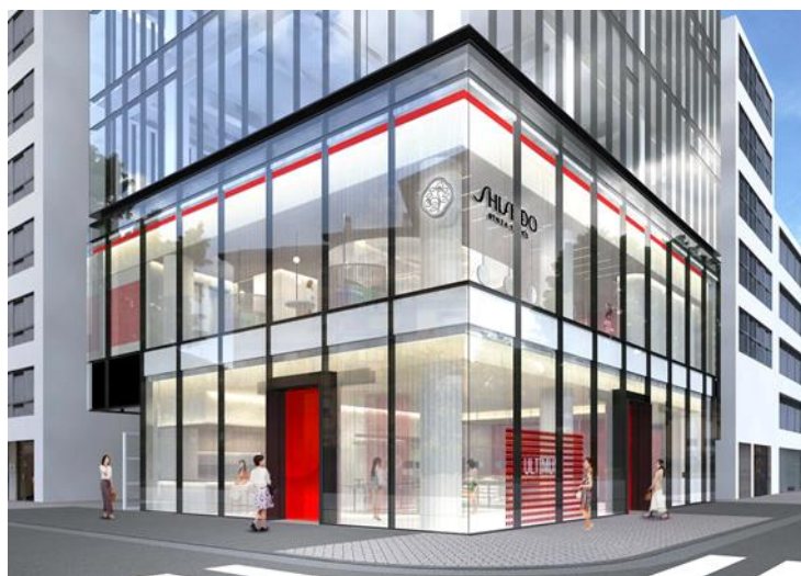
SHISEIDO Flagship Store exterior image

Through the store, SHISEIDO aims to meet new customers and improve recognition and understanding of the brand, stimulating the curious minds of beauty explorers. SHISEIDO will also continue to help each customer around the world discover their hidden charms and lead a beautiful, enriched life.