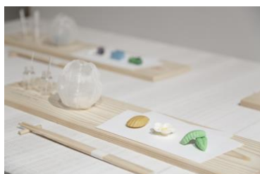
“Gum Tea Ceremony”

Research on gift aesthetic x Aroma x Memories x Manners at tea ceremony