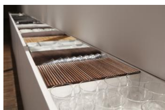
“Touch 24: Sound of Materials”

Research on aroma x Warmth of wood x Sound >>> Communication in touching