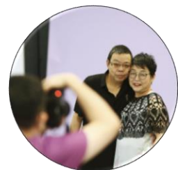
Photography session at the event in China