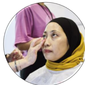
Makeup being applied for the Singapore event

institutions expressed the hope that this will become a regular event.