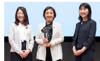
The “100 Best Companies Where Women Actively Take Part” 2022 ceremony

earned 1st place in the overall ranking of the “100 Best Companies Where Women Actively Take Part” 2022 at the “Survey on Female Workers’ Workplace Opportunities” conducted by Nikkei Business Publications’ Nikkei Woman together with Nikkei Womenomics Project of the Nikkei Group. This is the fourth time taking 1st place in the ranking.