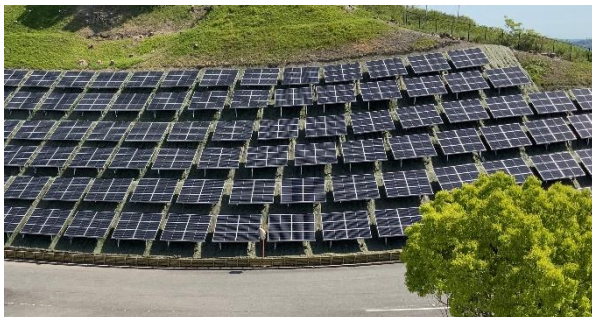
Solar panels of the Kakegawa factory

*At all business facilities of Shiseido, Scope 1+2